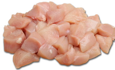
Diced Chicken Breast