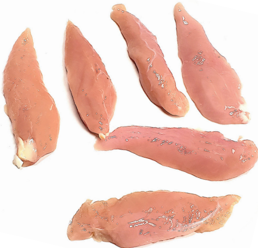
Clipped Chicken Tenderloin