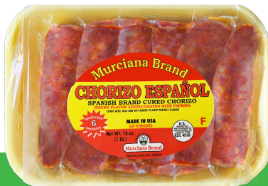
SPANISH SAUSAGE Item # 00147