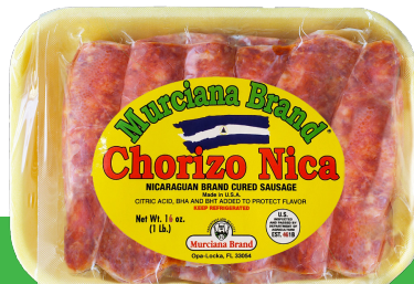
NICARAGUAN SAUSAGE Item # 00147