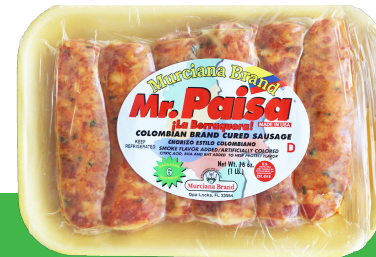
COLOMBIAN SAUSAGE Item # 00108