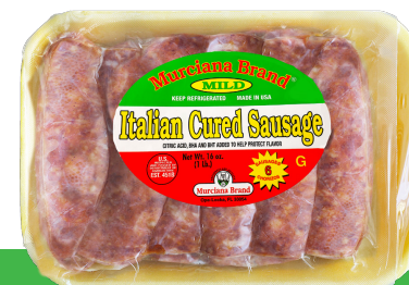
ITALIAN SAUSAGE MILD