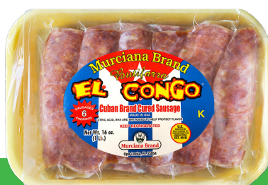
CUBAN SAUSAGE Item # 00107