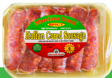
ITALIAN SAUSAGE SPICY