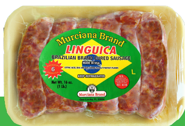
BRAZILIAN SAUSAGE Item # 00110