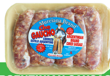
ARGENTINIAN SAUSAGE MILD